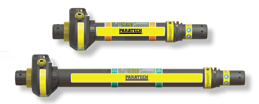
AcmeThread Strut Driver