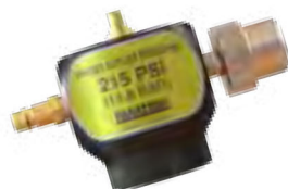
PRESET AIR LIFTING BAG REGULATOR 215 PSI CGA (14.8 BAR) Piston Type 5,500-0 psi / 379.2-0 bar CGA 347/346 inlet Net Weight: 3.6lb 1.6kg Part No. 22-895401G3