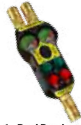
1 - Dual Deadman Bag Controller G3 22-890900G3-150