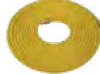
1 - Air Hose 3/8 in / 9.5 mm dia. x 16 ft / 5 m Yellow 22-890515