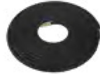
1 - Air Hose 3/8 in / 9.5 mm dia. x 16 ft / 5 m Black 22-890513