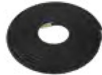
1 - Air Hose 3/8 in / 9.5 mm dia. x 16 ft / 5 m Black 22-890513