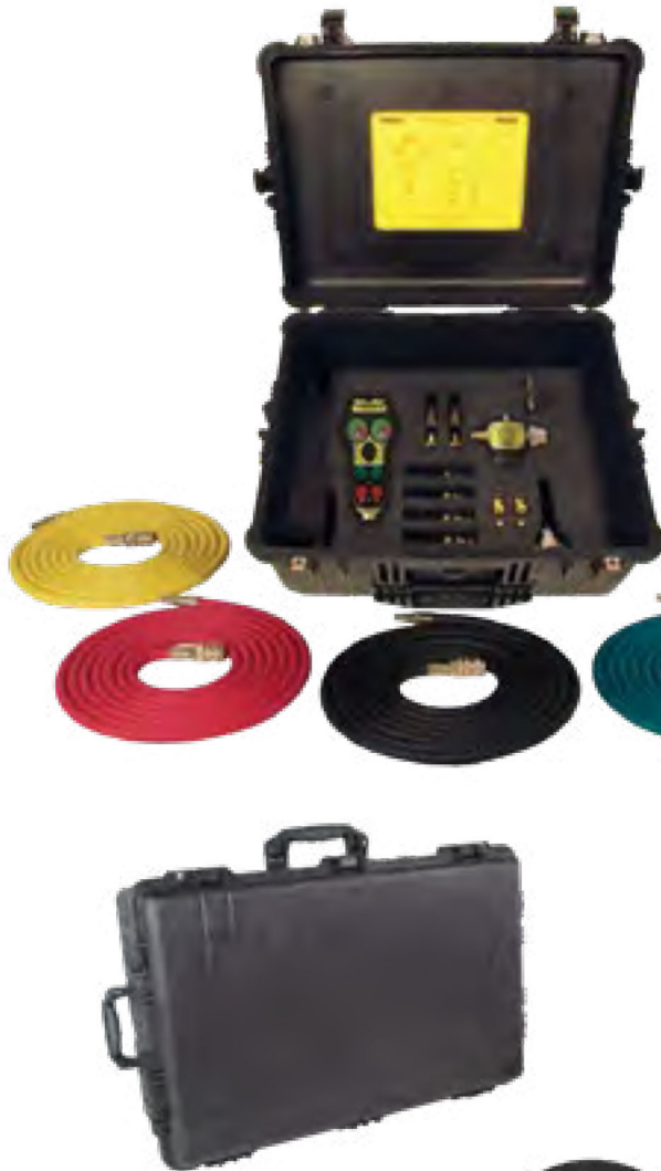
1 - Master Control Kit Case 22-890322