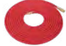
1 - Air Hose 3/8 in / 9.5 mm dia. x 16 ft / 5 m Red 22-890516