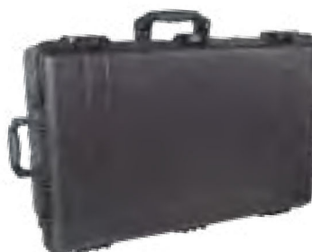
MASTER CONTROL PACKAGE CUSTOM CASE ONLY