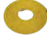
1 - Air Hose 3/8 in / 9.5 mm dia. x 16 ft / 5 m Yellow 22-890515