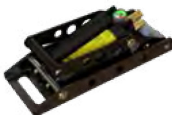
MANUAL AIR COMPRESSOR 2 STAGE - FOOT/HAND Net Weight: 14.7lb 6.7kg Part No. 22-800400