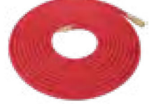
1 - Air Hose 3/8 in / 9.5 mm dia. x 16 ft / 5 m Red 22-890516