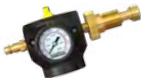
PRESSURE REGULATOR 215 PSI DIN (14.8 BAR) Piston Type Euro 5,500-0 psi / 379.2-0 bar DIN Net Weight: 3.8lb 1.7kg Part No. 22-895401DG3